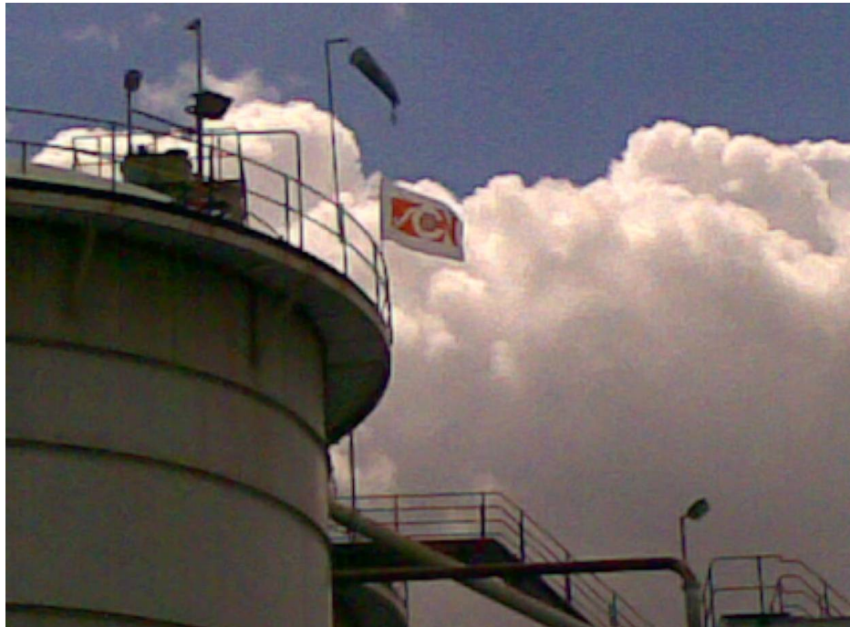
Cyanide Code Flag at Goldfield's Driefontein Operation in South Africa

In addition, ICMI has commissioned the production of Cyanide Code flags. The flags, which are 3 feet by 5 feet and cost US$100.00 each, show the Code logo on a white background. Certified operations can order a flag by contacting ICMI at +1-202-495-4020 or info@cyanidecode.org . Flying a Cyanide Code flag is a dramatic way to demonstrate that your operation is Code-certified.