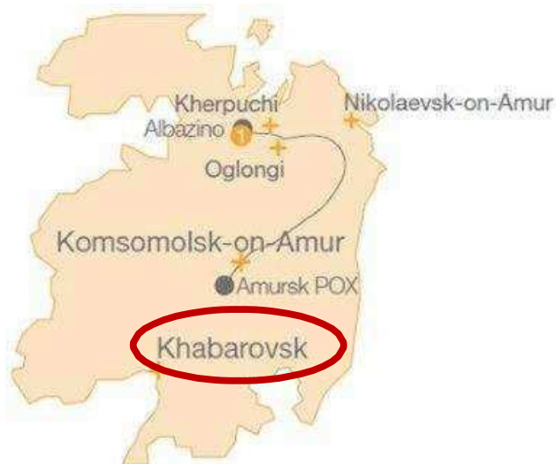
Figure 1.2: Location of AGMK