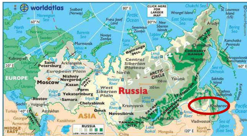
Figure 1.1: Map of Russian Federation

The AGMK facility is located in Amursk – the city has a population of approximately 43,000 people, located on the northern bank of the Amur river in the Khabarovsk territory of the Russian Federation, 350 km from Khabarovsk and 54 km from the large industrial city of Komsomolsk-on-Amur. See Figures 1.1 and 1.2.