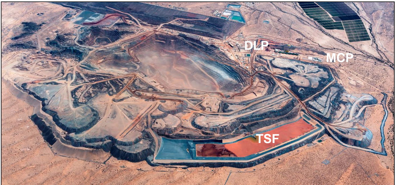
Figure 3: Aerial Photograph (Approximately 2014)