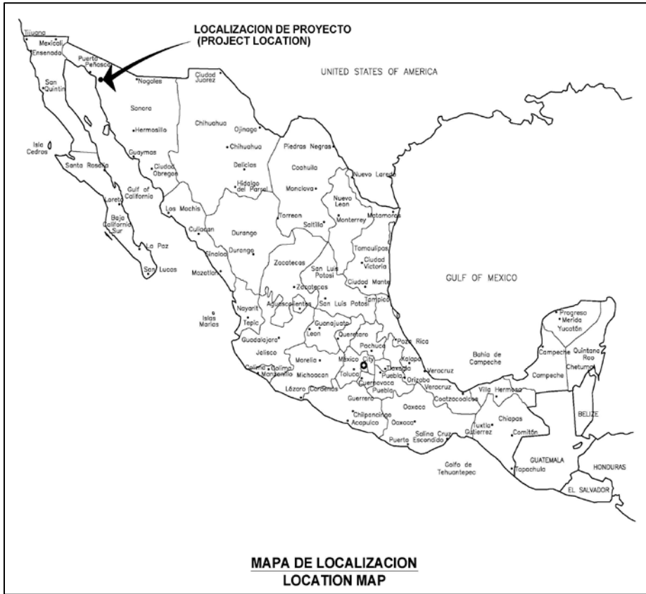
Figure 1: Regional Location Plan

filter presses. The resulting sludge is sent to the onsite refinery for smelting in the induction ovens to produce doré. The barren solution is returned to the agitation circuit.