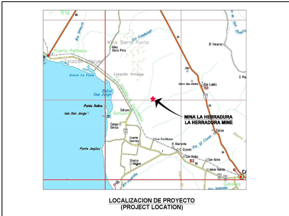
Figure 2: Local Location Plan